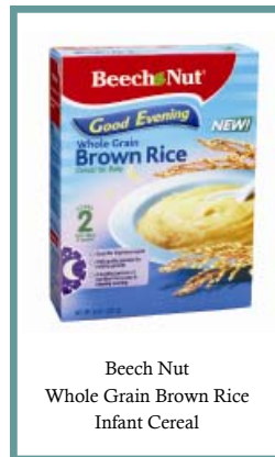
Beech Nut Whole Grain Brown Rice Infant Cereal