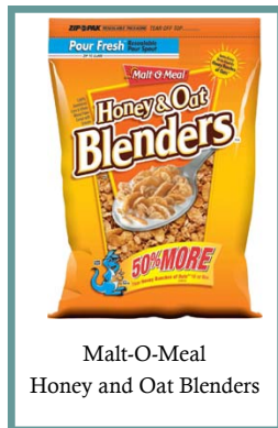
Malt-O-Meal Honey and Oat Blenders