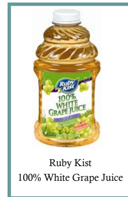
Ruby Kist 100% White Grape Juice