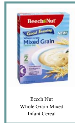
Beech Nut Whole Grain Mixed Infant Cereal