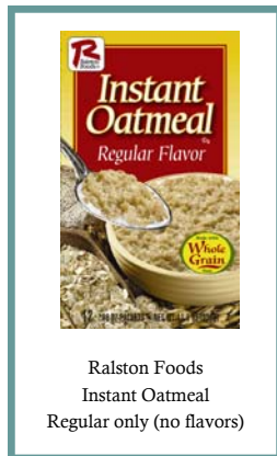
Ralston Foods Instant Oatmeal Regular only (no flavors)