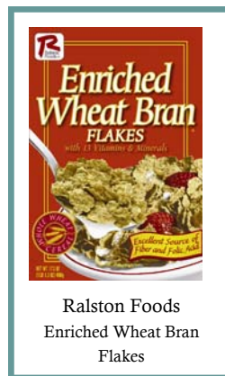
Ralston Foods Enriched Wheat Bran Flakes