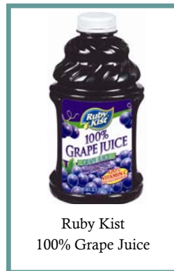
Ruby Kist 100% Grape Juice