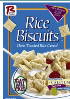
Ralston Foods Rice Biscuits