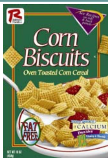
Ralston Foods Corn Biscuits