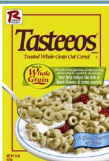
Ralston Foods Tasteeos