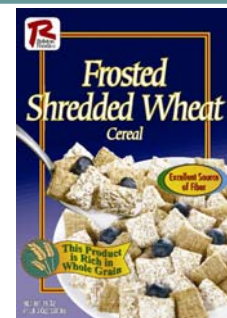
Ralston Foods Frosted Shredded Wheat