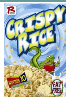
Ralston Foods Crispy Rice

NOTE: The Malt-O-Meal Company recently announced it is no longer producing the following Florida WIC-eligible cereals: Maple & Brown Sugar Mini Spooners, Vanilla Cream Mini Spooners, Strawberry Cream Mini Spooners, Scooters, and Crispy Rice. These cereals will remain WIC eligible as long as they are available.